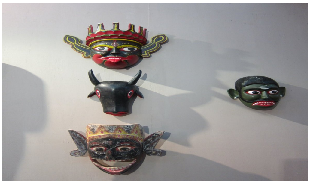
Fig. 3: Different types of masks are used in Gambhira Dance

The two leadingdances of the Gambhira festival are the Vana Dance, the Kali, and Narsinghi Dance. The Vana Dance is introductory to all dance performances. A group of people who cleansed their bodies woresacred attire and performed this dance. First, they pierce the skin on either side of their waist with the pointed iron arrows, usually one and a half feet in length, while uttering mantras. The two ends of these arrows are fastened with iron wear. Then they wrapped the arrowhead with rags immersed in mustard oil and lit it up. Finally, they dance to he beats of the dhak. They initiated their performance from the Gambhira mandap and visited all the mandapas and ways of the village.The Kali and Narsinghi Dance Dances are performed differently during the Gambhira festivals. The performers woreghagras or pajamas and dressed as Goddess Kali. The Kali dance forms are based on the talsof 'khemta,' 'adh khemta,' 'choutal,' 'daskoshi,' 'Gridhini Vishal,' 'Daggha-posta,' and 'Dumnikaharwa.' Narsinghi is a solo dance form and shares many characteristics of Kali.