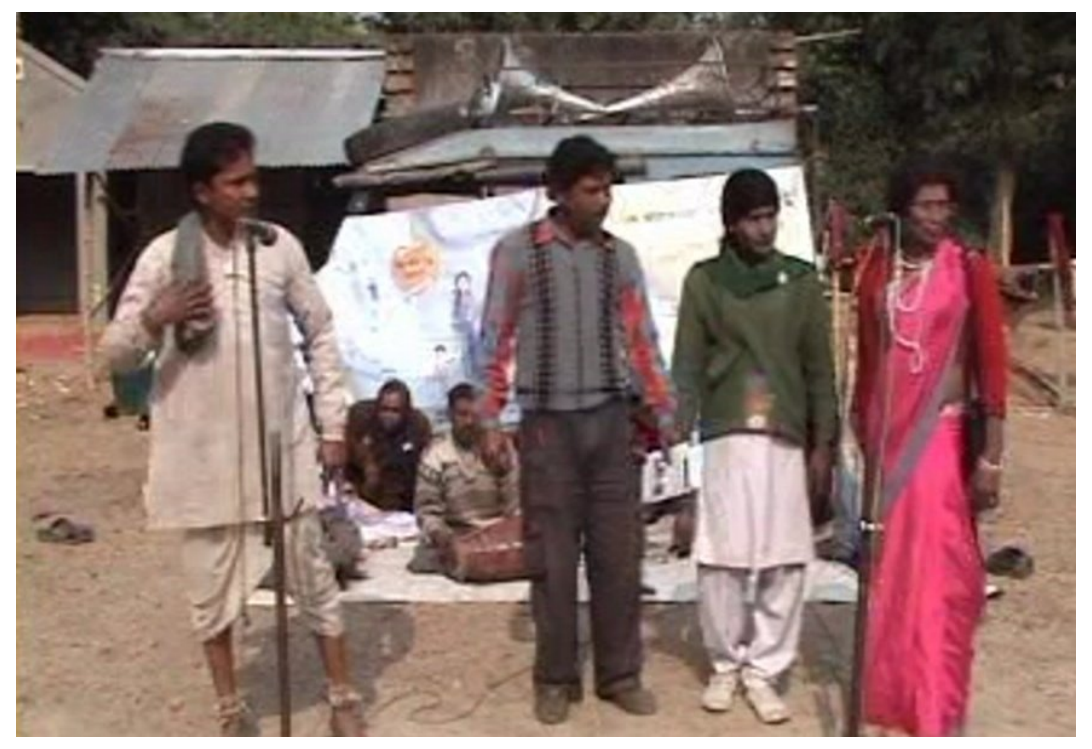
Fig. 2: Gambhira artists performing a programme against child marriage organized by State Government

During the performance of Gambhira songs sung, these are called Gambhira songs. A chorus accompanies the song. The singers are standing backstage. The costumes wornduring the performance are very bare. Both artisans wear a lungi (a long piece of cotton cloth wrapped around the waist and extending to the ankles). The grizzly-bearded grandfather wears a straw hat and has a stick in his hand. The grandson