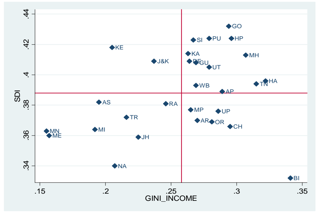
Figure1: Scatter plot between SDI and income inequality for Indian States (2004-05)

Note: Abbreviation of the states are given in the appendix